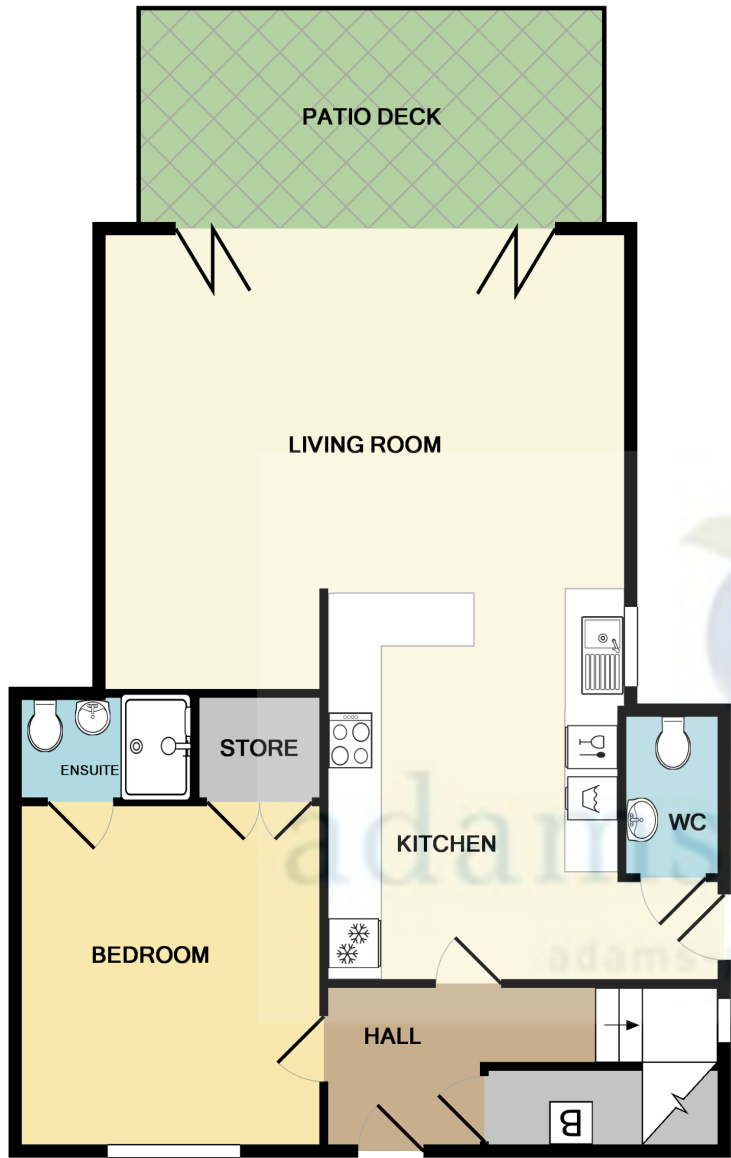
GROUND FLOOR APPROX. FLOOR AREA 789 SQ.FT. (73.3 SQ.M.)